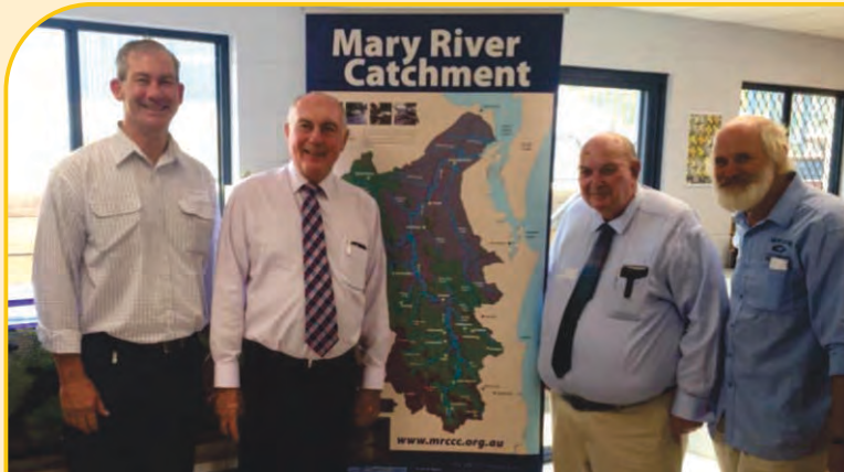
After more than ten years in the making, the Mary River Catchment Coordinating Committee (MRCCC) now has a home of its own after raising more than $500,000 in donations to fund the Mary Catchment Resource Centre.