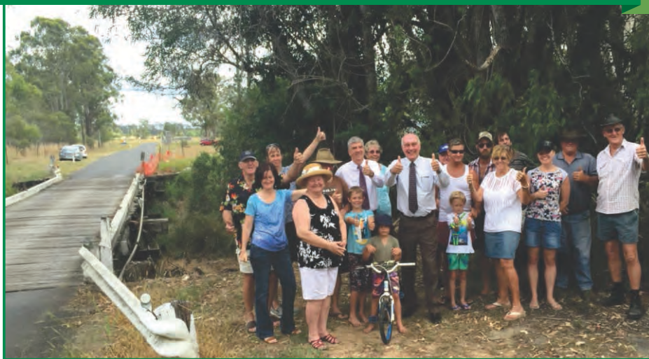
Warren Truss joins with the local community to celebrate funding to replace the Gutchy Creek Bridge at Gundiah. The new two lane bridge will also include a pedestrian access to make it safer for local children walking to school.

The Coalition Government has also allocated $955,500 to upgrade the Goomong Road bridge at Kandanga and $920,500 for the Kandanga Creek Road bridge, with the Gympie Regional Council contributing matching funding.