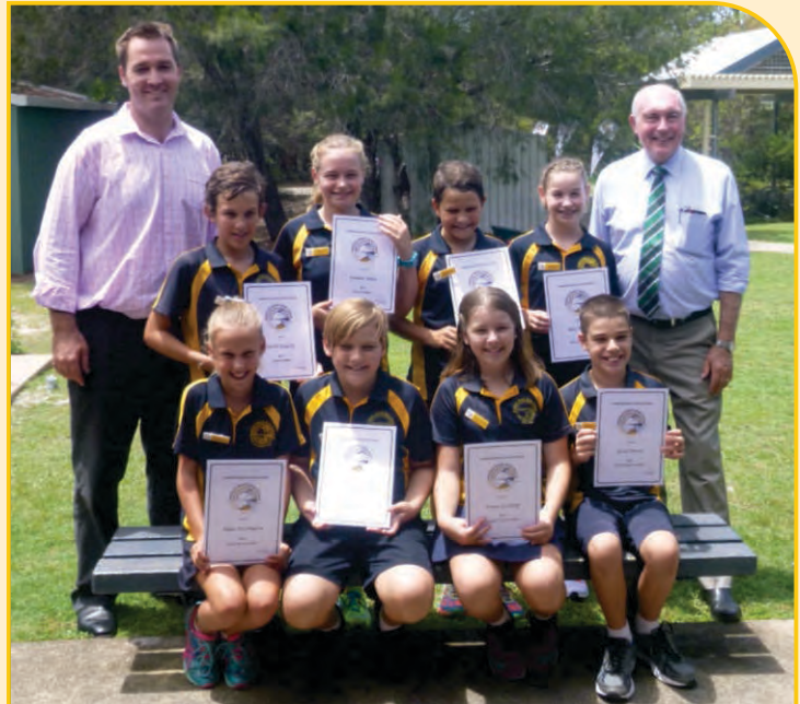
It was a pleasure to present School Captain's badges to students at Rainbow Beach State School