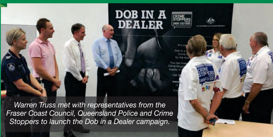
Warren Truss met with representatives from the Fraser Coast Council, Queensland Police and Crime Stoppers to launch the Dob in a Dealer campaign.

Dob in a Dealer, a new joint initiative between the Australian Government and Crime Stoppers will help to reduce the enormous damage drugs do to individuals, families and the community.