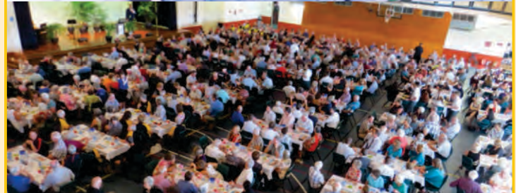
Rev Tim Costello was the guest speaker at Australia's largest Mayoral Prayer Breakfast at the Pavilion in Gympie, attended by 650 people.