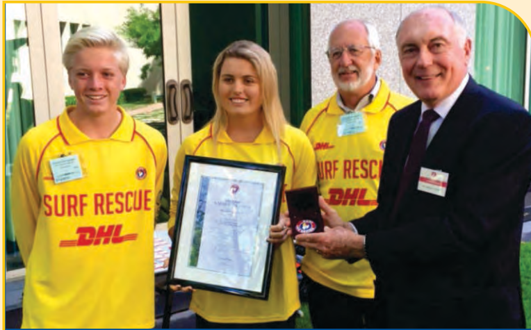
Australia's surf life savers do a great job keeping our beaches safe and it was a pleasure to present Noosa Heads Surf Life Saving Club with a special award at Parliament House for their Rescue of the Month, recognising their courageous efforts rescuing three swimmers in trouble.