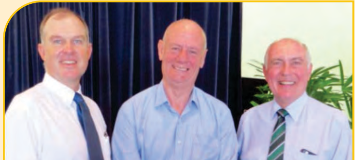
It was an honour to open the new MRCCC Resource Centre in Gympie and I congratulate the volunteers, donors and staff for their continuing efforts to improve the Mary River Catchment and beyond.